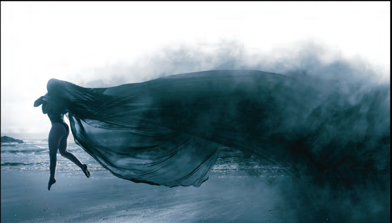
Ginkgo Greene @ginkgogreene