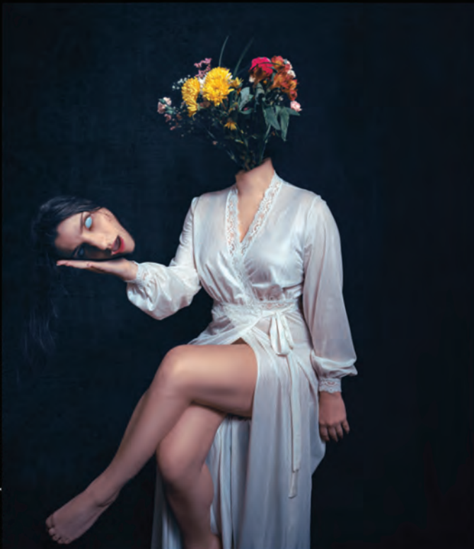
Title: Bouquet of flowers: Self Portrait